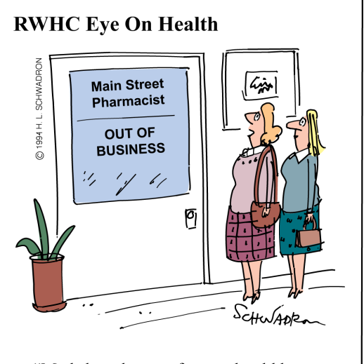
"Meds bought out of town should have a warning label—Dangerous to Local Service."

"From 0800 to 1030 I go to rounds, then write orders for dose adjustments, order labs, and head back to the pharmacy to enter my own orders into the computer system and approve them. Somewhere in that time, I grab a second cup of coffee and review all cultures drawn since yesterday and the ones that have results and contact prescribers if any antibiotics need to be changed. Around 11:00, I receive a call from a Nurse